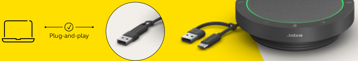
USB C and USB A connectors included

Connect the USB cable to any available USB C or USB A port on your computer. The status LED ring will light up white to indicate the speakerphone is connected and powered on.