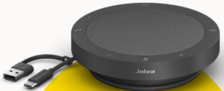
MS TEAMS & UC VARIANTS

To help take care of our planet, we consider sustainability carefully at every stage of product development. The outer casing of Speak2 40 is made with over 50% sustainable materials** and has a number of built-in parts that can be repaired or replaced. Better sustainability = longer speaker life = great calls for you and your team for years to come.